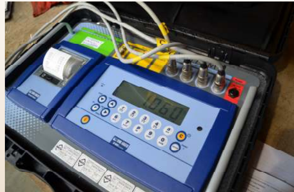
Brief case style display unit with printer

LCD screen, backlit key pad, inbuilt battery and charger with 10 hours of battery life all make this very user friendly.