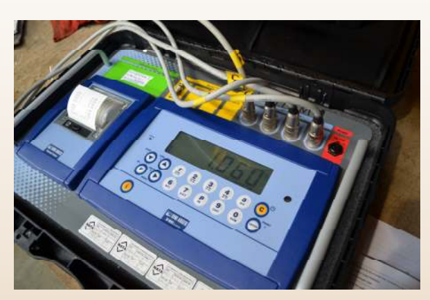
Brief case style display unit with printer

LCD screen, backlit key pad, inbuilt battery and charger with 10 hours of battery life all make this very user friendly.