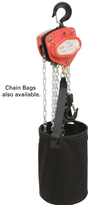
Chain Bags also available.